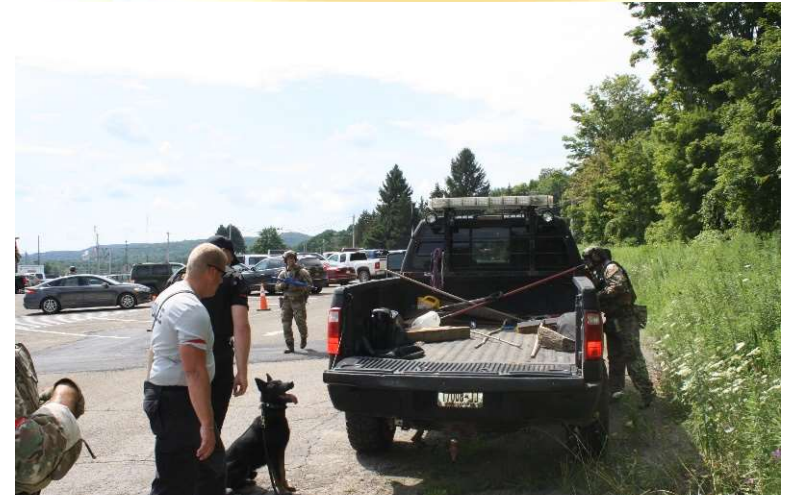
Full-scale Emergency Exercise (2019) with mutual aid from Cattaraugus County Special Response Team