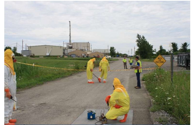
Full-scale Emergency Exercise (2019) with Controllers and Observers