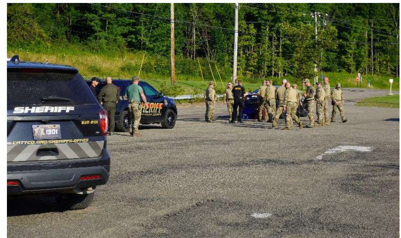
Full-scale Emergency Exercise (2019) with mutual aid from law enforcement agencies