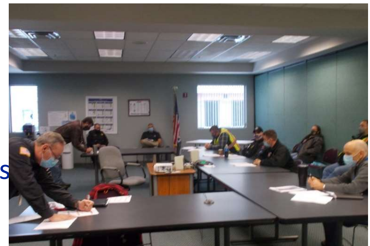
Active Shooter Tabletop Drill (2020)