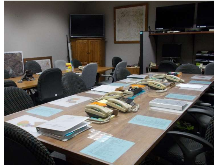
Emergency Operations Center (Ashford Office Complex)