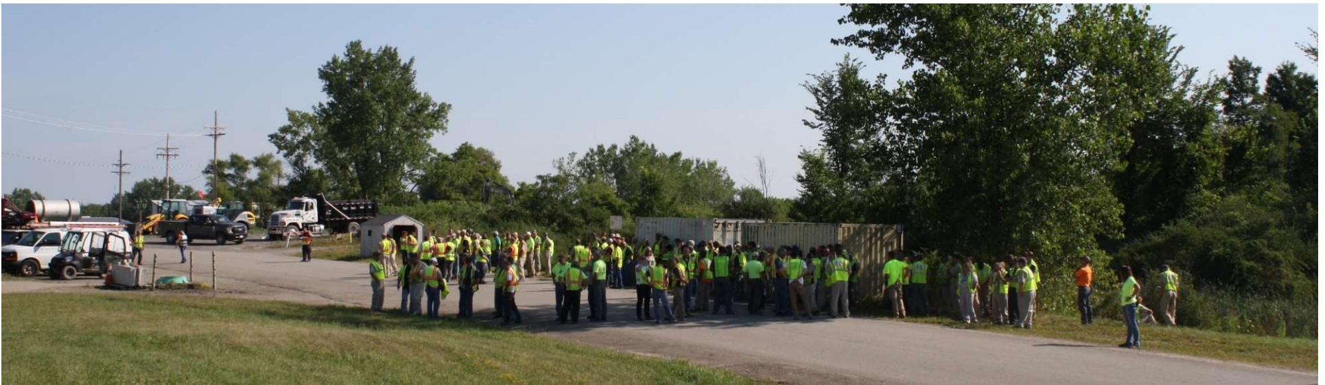
Full-scale Emergency Exercise (2019) in which employees were relocated to a pre-determined safe area

The West Valley Demonstration Project's Emergency Management Program provides a plan of action to be followed by all personnel in the event of any operational, civil, natural phenomenon, or security occurrence in order to mitigate such emergencies in the most expeditious manner with minimal impact to employees, the public, the environment, property, or facilities.