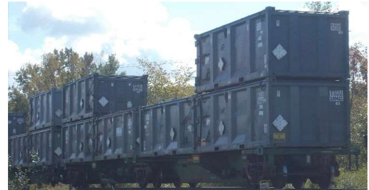
Actual waste containers that will be used for Main Plant demolition