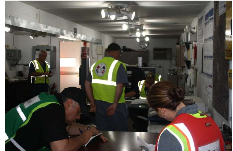
Incident Command during Full-Scale Emergency Exercise (2019)